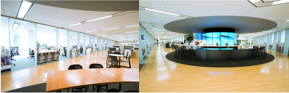
The Nippon Foundation Parasports Support Center Shared Office

A barrier free open-space office provides the national federations working environment where staff can concentrate on the operation with confidence and pride, and facilitates communications among the federations.